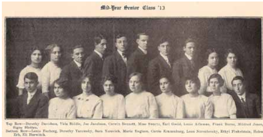
Mid-Year Senior Class '13