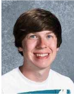
Hamilton Family Scholarship East High Alumni Foundation True Wheelodon Simpson College Information Systems and English Marching Band's Success at Waukee Invitational my Sophomore Year