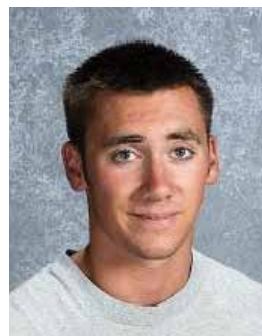
Thomas C. Anderson Memorial Garry R. Saddoris Memorial East High Alumni Foundation Hunter Hall

Winning the State Softball Championship and Being Runner-up Twice